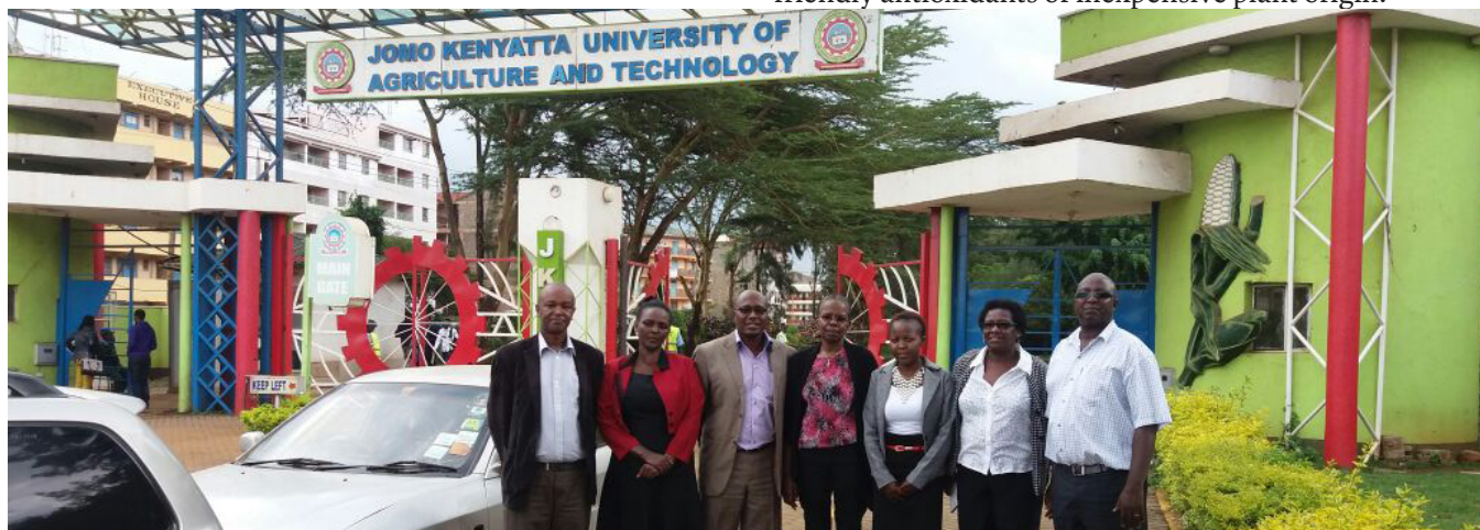
2016 workshop participants, Kenya

time. This can cause disruptions in electricity transmission and distribution networks running into the thousands of dollars, in addition to posing pollution risks. Why not use biodegradable composites that respect the environment? So the scientists analyzed extracts from the Mareya micrantha , a local plant, and from the Canadian paper birch. In addition to proving that the extracts of these plants prevent the oxidation of oils, the researchers opened a new avenue for research into environmentally friendly antioxidants of inexpensive plant origin.