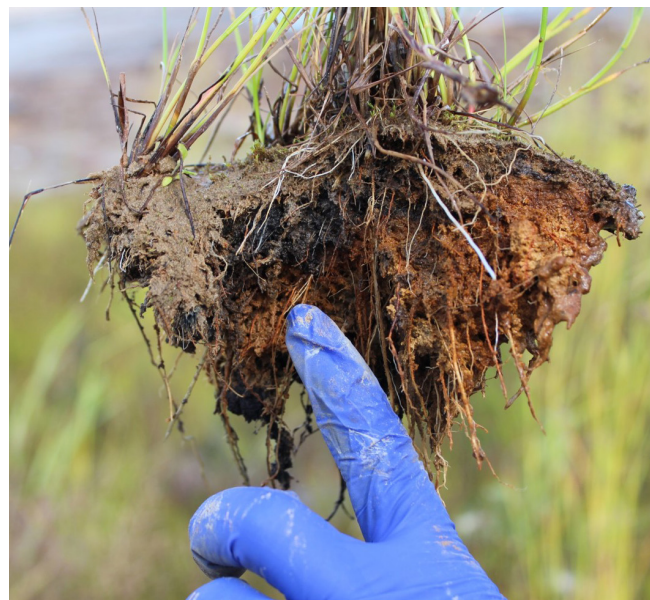
Isolating the fungi from plants on contaminated soil, Ghana

adventure of a Canadian-African partnership, a first for him. The plan: to study the use of ITC in business, get the perceptions of entrepreneurs and public servants about new technologies and identify obstacles that slow their adoption in the country.