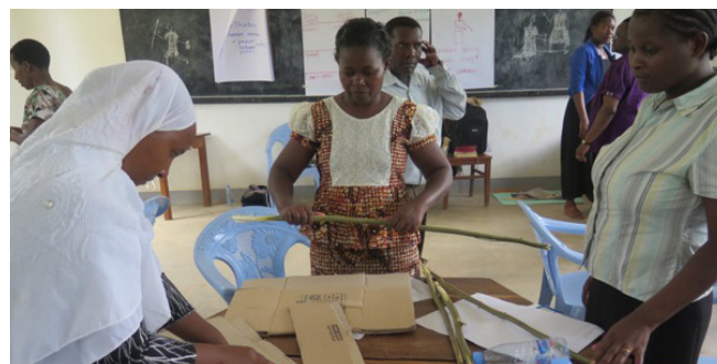
Using found materials, teachers create teaching resources, Tanzania