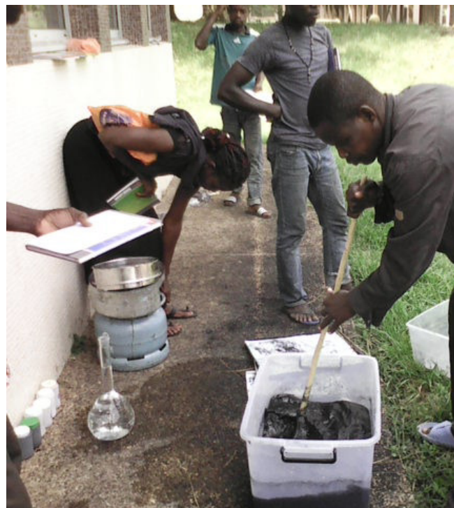
Preprocessing stage of activated charcoal, Ivory Coast