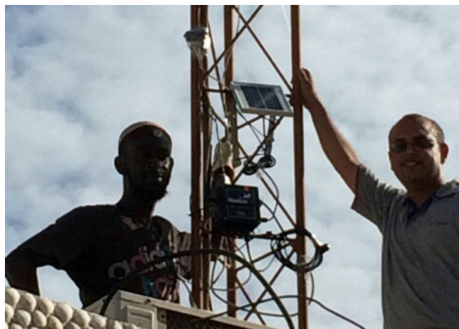
A relay antenna built on top of a building, Senegal