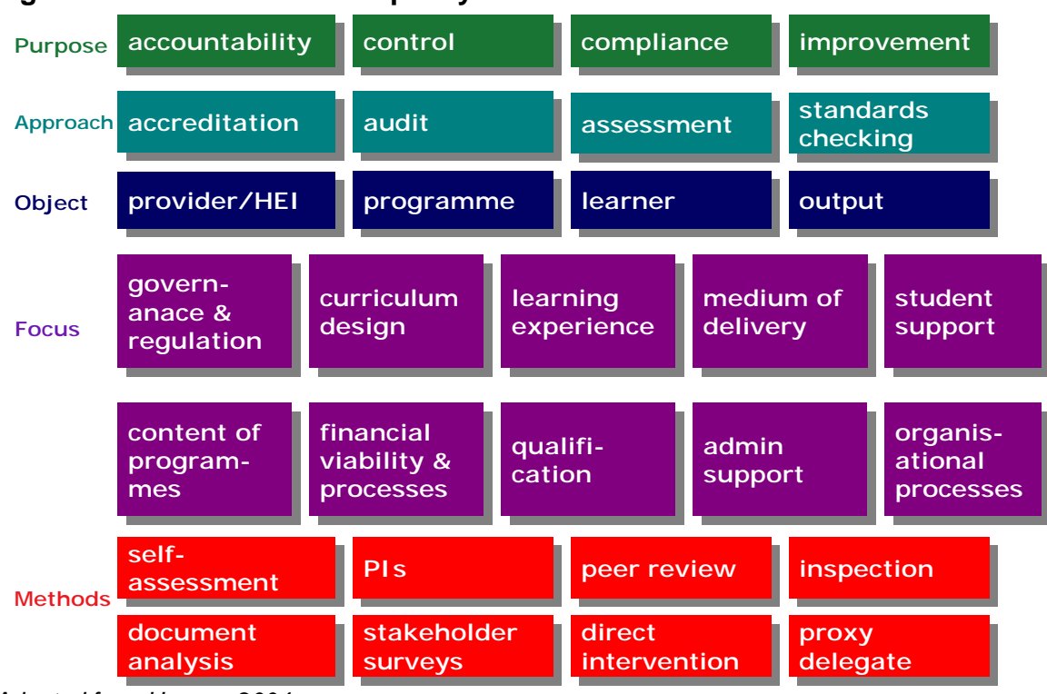
Figure 1: Facets of external quality assurance