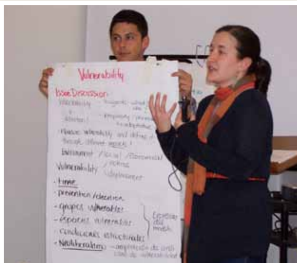
The two-day workshop allowed members of the Latin American Network on Forced Migration to exchange ideas and experiences.