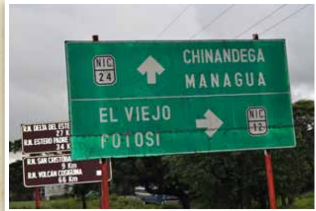
A road sign points to Managua, Nicaragua's capital city near the Pacific coast.

They learned that drug trafficking and organized crime appear inextricably linked to the sexual exploitation of children and trafficking of women. They were also able to study how the lives of people in municipalities bordering other countries are vastly different from those in central regions of the country. Drawing on initial analysis of their data, the team secured funds from The United Nations Development Fund for Women to expand their consultations to the Atlantic coast and with bordering municipalities in Costa Rica.