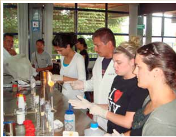
Students test water quality in the laboratory.

As a direct result of the project, several Mexicans pursued studies on Mexican migrants at the Université de Montréal. It has also stimulated new research into Mexicans who seek asylum in Montreal.