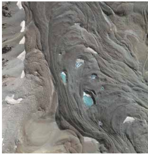
< Satellite images like this one help locate glaciers under thick layers of rock.