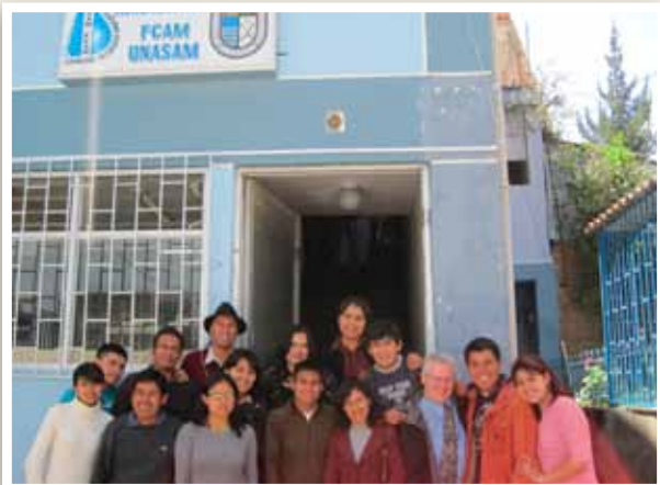
The research team gathered outside UNASAM in Peru.