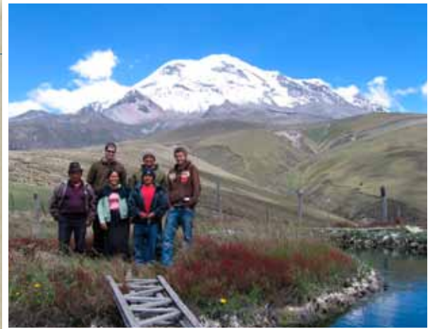
Canadian students from Lakehead University and Ecuadorian students from Escuela Superior Politécnica de Chimborazo stand below the Chimborazo volcano with the community leader of Chorrera Mirador, a small Andean community.