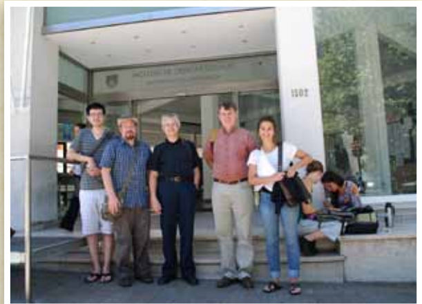
Members of the research team stand outside the Universidad de la República.