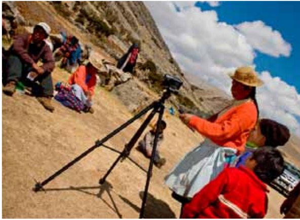
Indigenous farmers use video to document their concerns for policy-makers.