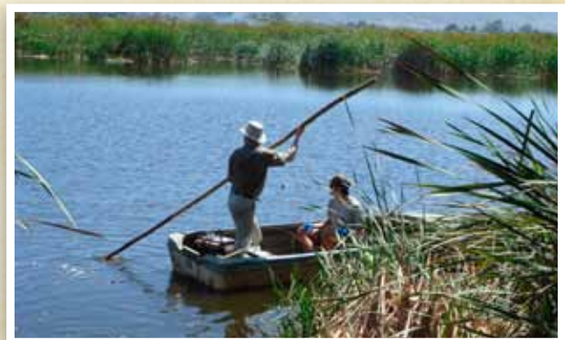
Researchers conducting field work on Lake Zapotlán.