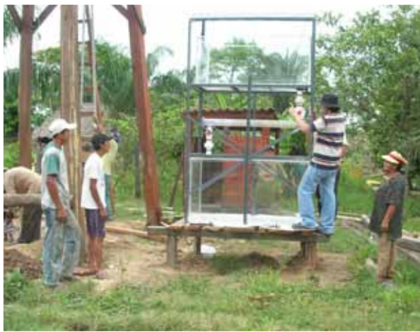
As the UV water treatment system is installed, residents of the rural community of Cerro Grande are trained to use it.