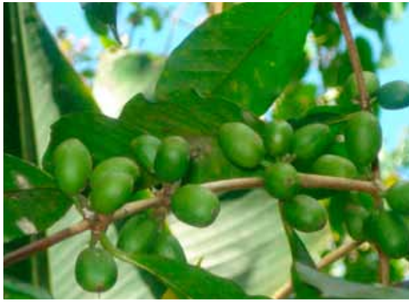
Coffee beans not yet ripe for picking.