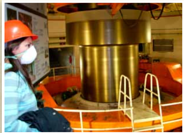
On a tour of the Itaipu power plant in Brazil, a student pauses by a turbine.