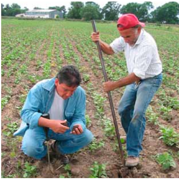
< Examining soil properties at a university research site in Independence Basin, central Mexico.