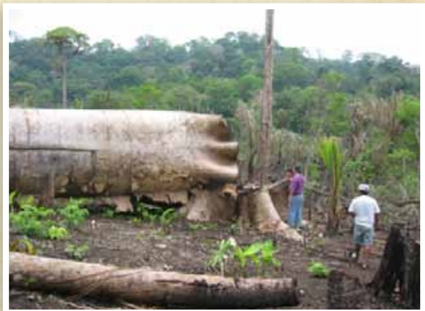
Deforestation contributes to the deterioration of soil and air quality.