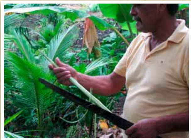
Looking for appropriate plants to restore soil fertility.